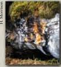
Black bear den

Both black and grizzly adult females have a physical adaptation called "delayed implantation"—the fertilized egg doesn't implant in the uterus unless the female has enough fat reserves to grow and nurse cubs. Born into a secure den environment, the tiny, blind cubs (usually two) suckle on their sleeping mother's rich milk.