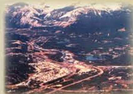
Sharing the valley with wildlife. The town of Jasper in Jasper National Park.

It's becoming harder for bears to avoid bumping into people even in our parks. These protected areas are an important part of the remaining habitat for black and grizzly bears in North America.