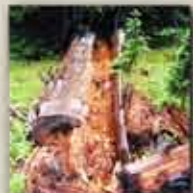
Ants and other insects in rotten logs