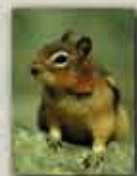
Golden-mantled ground squirrel

As snow retreats, plants flourish and bears range widely to find these green pockets.