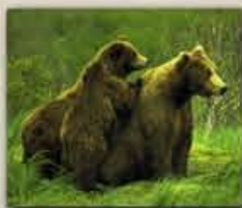
Sow grizzly and young cubs

Here in the Rockies, grizzly bear cubs may remain with their mothers for up to 5 years—learning the ropes for survival in the mountains. Female grizzlies aggressively defend their cubs from dominant male bears and other threats. Black bear cubs are ushered up trees for protection from adult black bear males and grizzly bears.